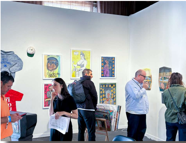
PASC artworks (center) on the walls of White Columns Booth, NADA Miami, 2024